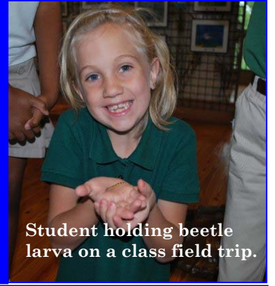
Student holding beetle larva on a class field trip.

2009 is officially over, but what a year we had here at 5 Rivers! From our first January field trip to our December holiday celebration, we had a blast introducing and sharing the Mobile-Tensaw Delta with thousands of guests from around the world! We would like to thank everyone who came out and not only visited us, but also participated in our many ongoing events. Don't worry though, if you missed any of the happenings last year, even more is planned for 2010.