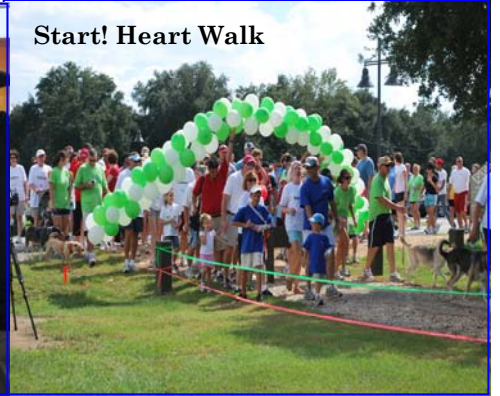
Start! Heart Walk