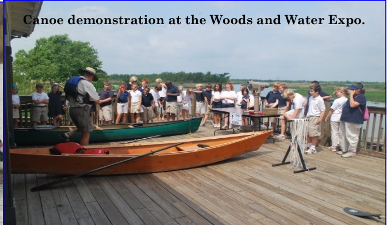
Canoe demonstration at the Woods and Water Expo.