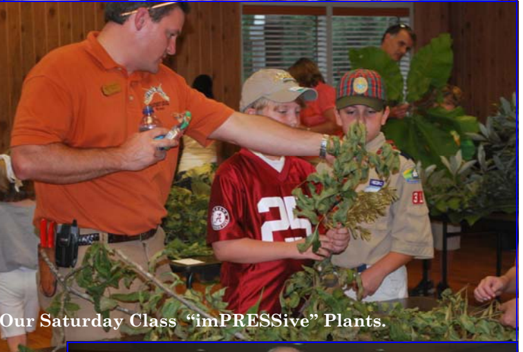
Our Saturday Class "imPRESSive" Plants.