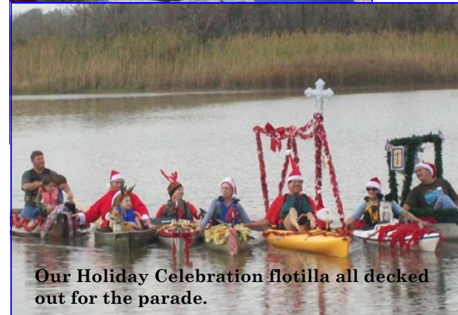
Our Holiday Celebration flotilla all decked out for the parade.