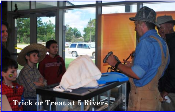
Trick or Treat at 5 Rivers