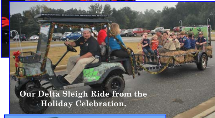
Our Delta Sleigh Ride from the Holiday Celebration.