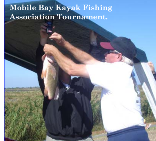
Mobile Bay Kayak Fishing Association Tournament.

2009 is officially over, but what a year we had here at 5 Rivers! From our first January field trip to our December holiday celebration, we had a blast introducing and sharing the Mobile-Tensaw Delta with thousands of guests from around the world! We would like to thank everyone who came out and not only visited us, but also participated in our many ongoing events. Don't worry though, if you missed any of the happenings last year, even more is planned for 2010.