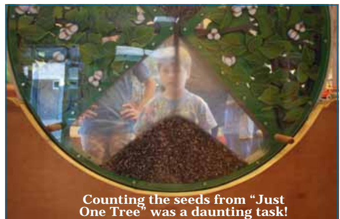
Counting the seeds from "Just One Tree" was a daunting task!

Though the contest is now complete, the "Just One Tree" exhibit will be revised and will remain in the Apalachee Exhibit Hall as a reminder of the challenges our public lands continue to face from nonnative, invasive plants.