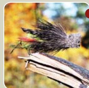
▶ DAVE'S HOPPER