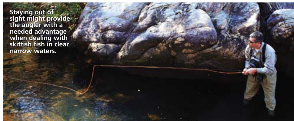
Staying out of sight might provide the angler with a needed advantage when dealing with skittish fish in clear narrow waters.

Black Gnats, Elk Hair Caddis, Royal Wulff, Hoppers, and Poppers are also good flies to try in northeast Alabama. I have had good luck with Copper John and Czech Nymphs for under the surface action.