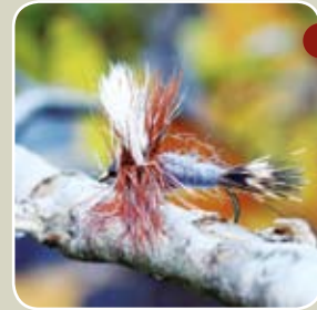
▶ ADAMS IRRESISTIBLE